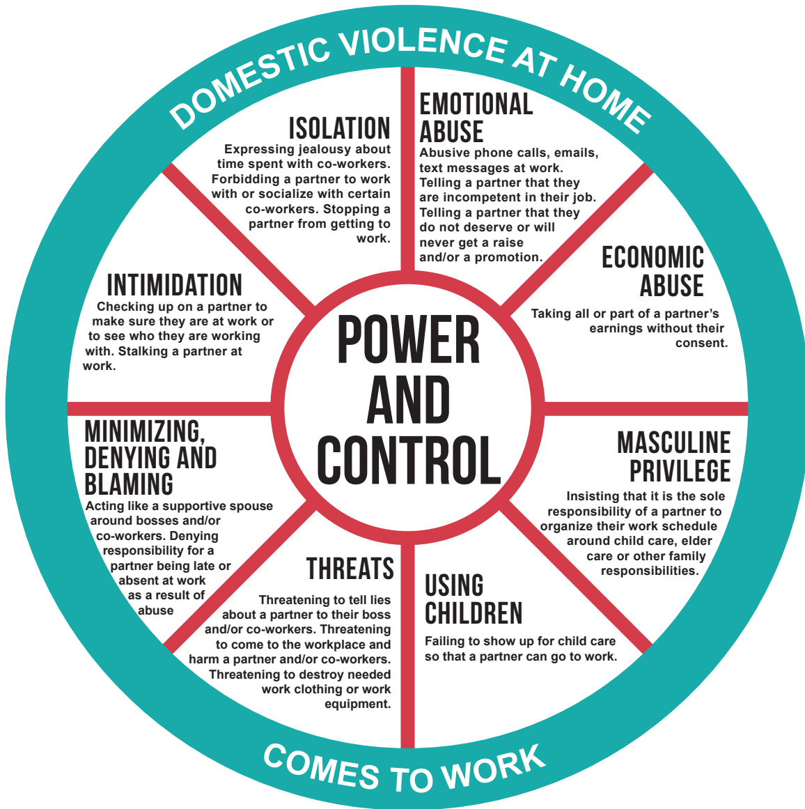
CHART 1: IMPACT OF DOMESTIC VIOLENCE AT WORK

This version of the Power and Control wheel, was adapted by the Centre for Research and Education on Violence Against Women & Children (CREVAWC), Western University, Canada with permission from the Domestic Abuse Intervention Project in Duluth, Minnesota and Futures Without Violence.